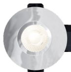
Polished Chrome Bezel

* This product is compatible with most dimmer switches, please refer to dimming compatibility sheet for up-to-date list of compatible dimmer switches.